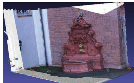
Result of registration